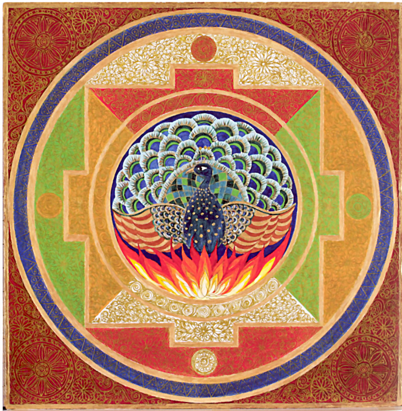
The Strength of 10,000 Women